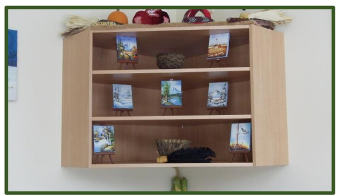
Figure 1. Kastowahs, natural items and native prints

would be provided with light and a clear view of the outdoors. The educators also included symbols of First Nations' culture as part of the décor: a dream catcher; a kastowah (male headdress); natural items such as pine cones and twigs placed in baskets; jars of shells or stones; a sculpture of a turtle or bear (See Fig. 1 & Fig. 2). Their aesthetic considerations augmented the developing pedagogy of Entewate'nikonri:sake.