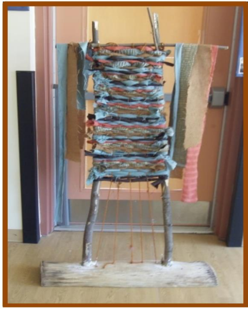
Figure 6a. Weaving from the project: Our Relationships with Kanien'kehá:ka Long Ago

discussions between us about the "languages" of Mohawk culture. This helped me to see how arts methodology could expand the teachers', students' and an art audience's cultural experiences.