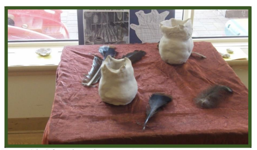
Figure 6b. Pottery (clay) from the project: Our Relationships with Kanien'kehá:ka Long Ago