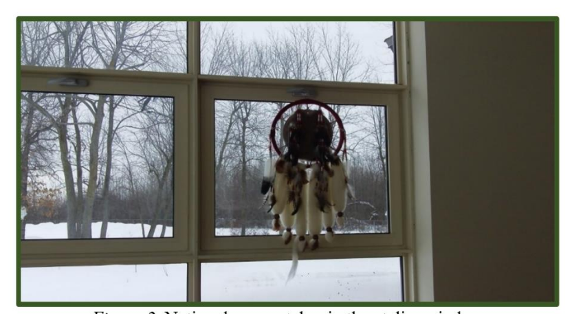
Figure 2. Native dream catcher in the atelier window