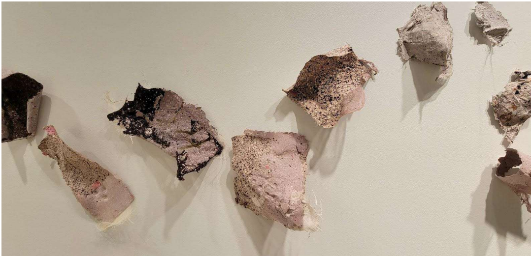
Author, 2023, The Gesture of Hope, recycle paper, the skin of arbutus tree, textile.

A Sunday evening I lingered in the silence of the studio Where shreds of scrap paper lay on the table The paper held the fragments of my mind that spilled in ink when I was weary, worried, Caught between two worlds. Here and there I remember it, I was lost, still, motionless, frozen hopeless I see no glimpse of light Is this despair I feel? What does it signify? The words have lost their meaning, Like hollow shells, they lie, Devoid of any sense.