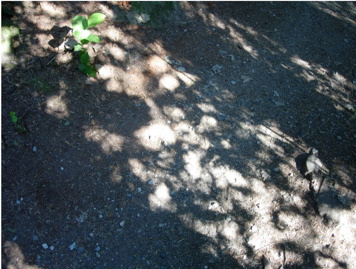
Rita L. Irwin. (2010). Proposition for Attending #8 . Digital photograph.