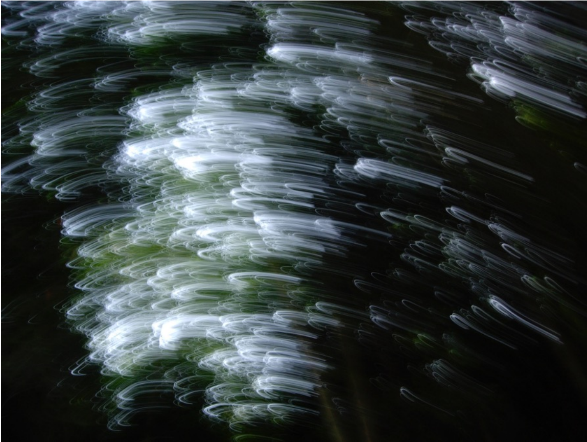
Rita L. Irwin. (2010). Proposition for Attending #5 . Digital photograph.