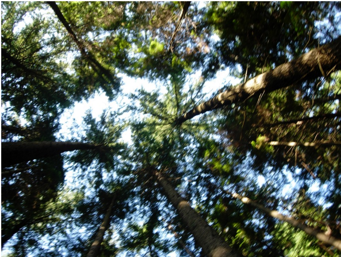
Rita L. Irwin. (2010). Proposition for Attending #4 . Digital photograph.