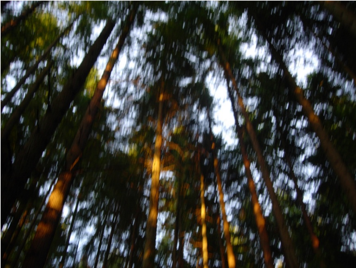
Rita L. Irwin. (2010). Proposition for Attending #10 . Digital photograph.