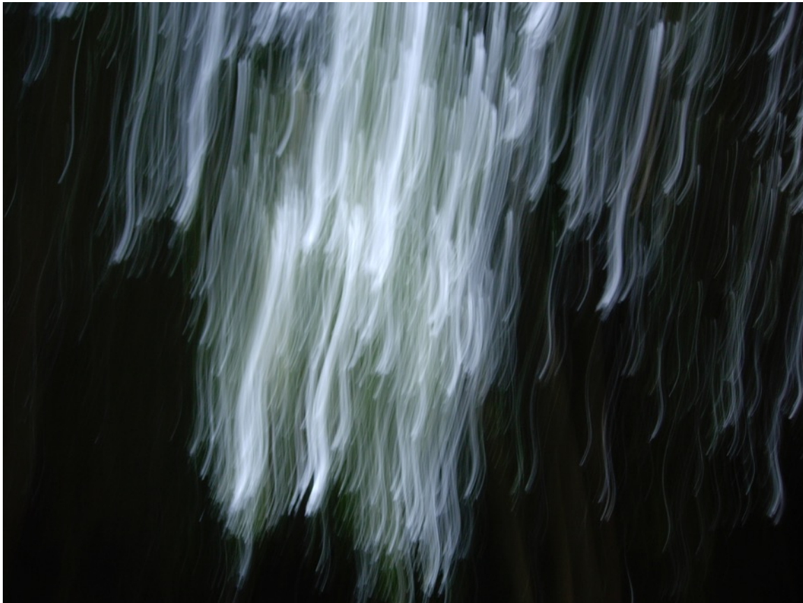
Rita L. Irwin. (2010). Proposition for Attending #2 . Digital photograph.