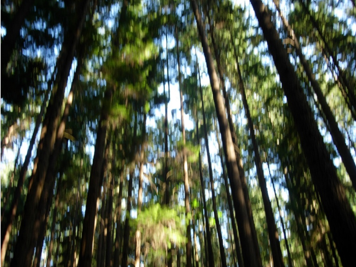
Rita L. Irwin. (2010). Proposition for Attending #6 . Digital photograph.