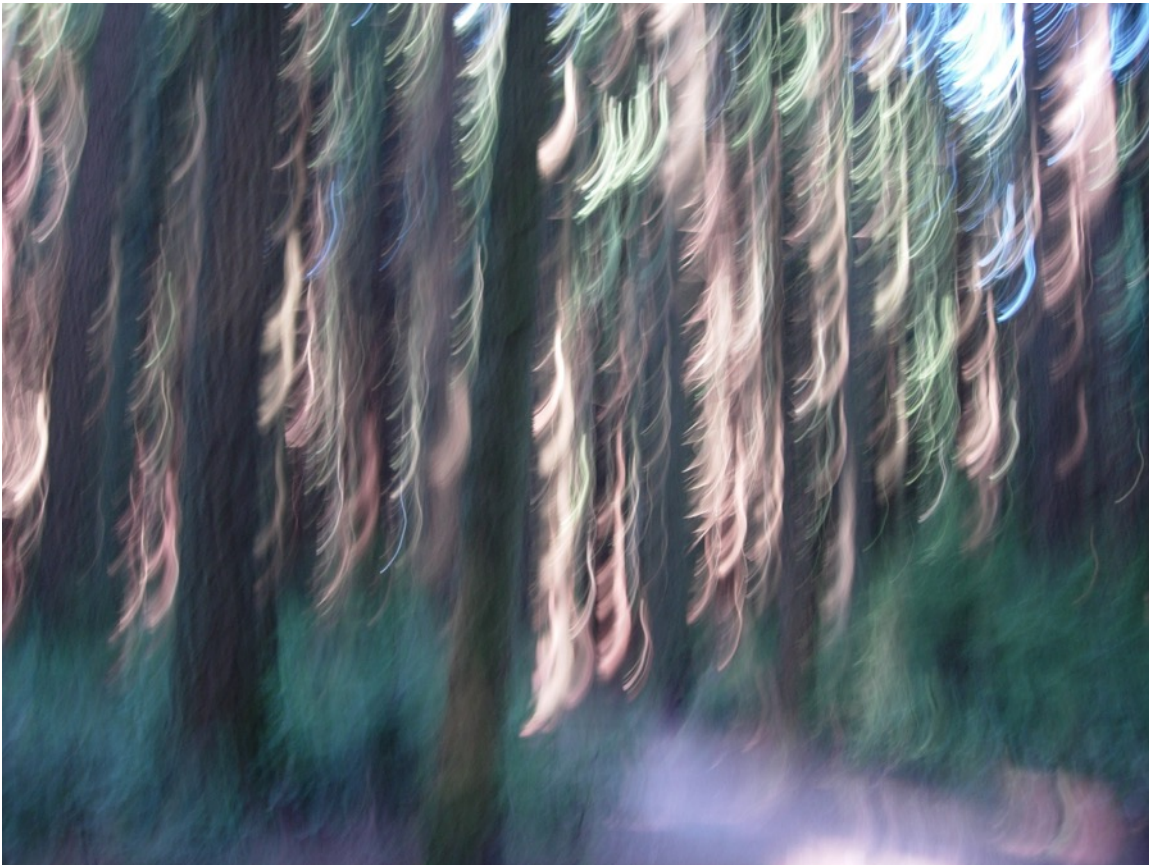
Rita L. Irwin. (2010). Proposition for Attending #9 . Digital photograph.