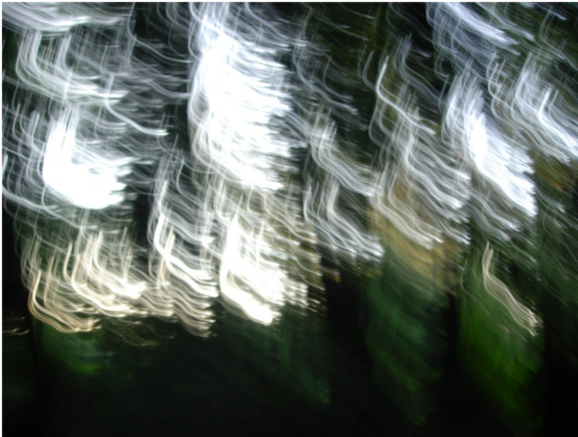
Rita L. Irwin. (2010). Proposition for Attending #7 . Digital photograph.