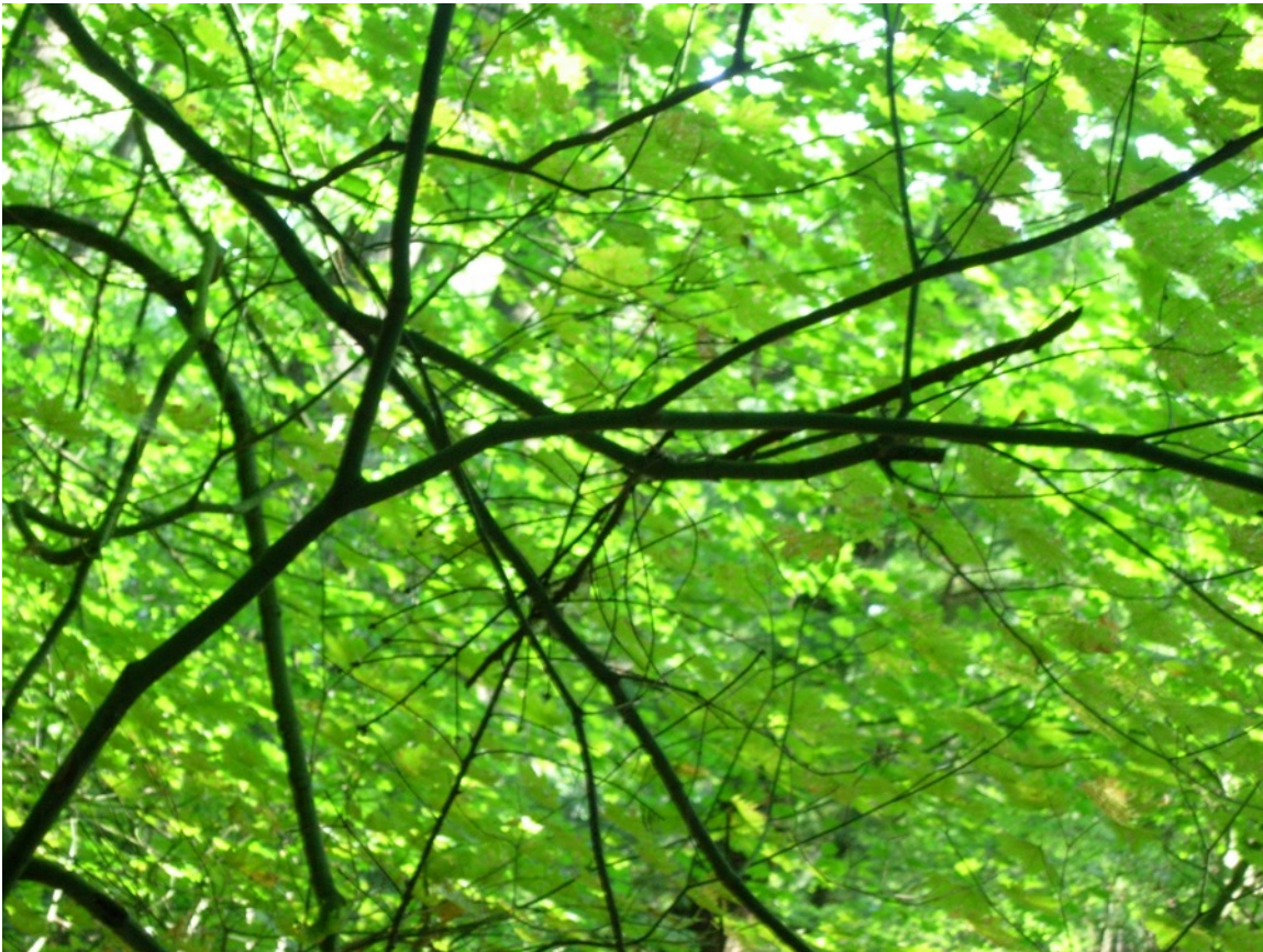
Rita L. Irwin. (2010). Proposition for Attending #1 . Digital photograph.