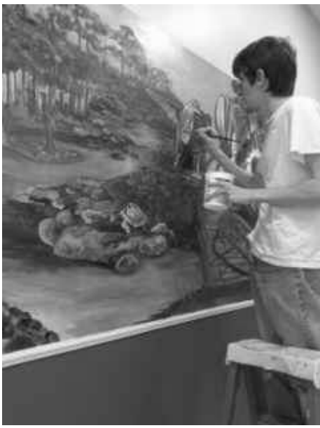
Figure 2 University student paints landscape created from photos of regional fauna.