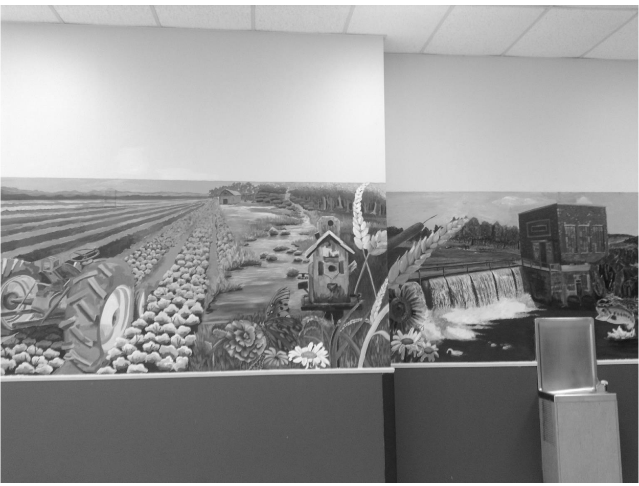
Figure 5 Left side of mural illustrating local landscape.