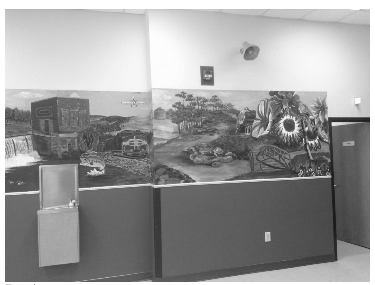
Figure 4 Center and right side of mural including local landmarks.

Overall, the experiential learning in studio core content was combined with curriculum appropriate for future art educators that included art criticism, recognition of diversity, contemporary art themes, and civic involvement. Through problem solving, collaboration, practicing art skills in an authentic environment, and learning from one another as well as from previously unrecognized community members, the students gained valuable knowledge that they felt could help them in their future art classrooms. Their reflections suggest community-based art education has something to offer curriculum for future art educators (see figures 4 and 5).