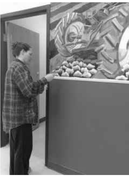
Figure 3 University student paints landscape typical of rural farming community.